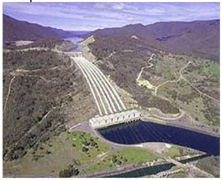
Engineer a Dam Developed by IEEE as part of TryEngineering www.tryengineering.org

Hydro Electricity has a history of development in Australia and is currently the largest supplier of Australia's renewable energy. Tasmania and The Snowy Mountains have Australia's largest Hydro Electricity operations.